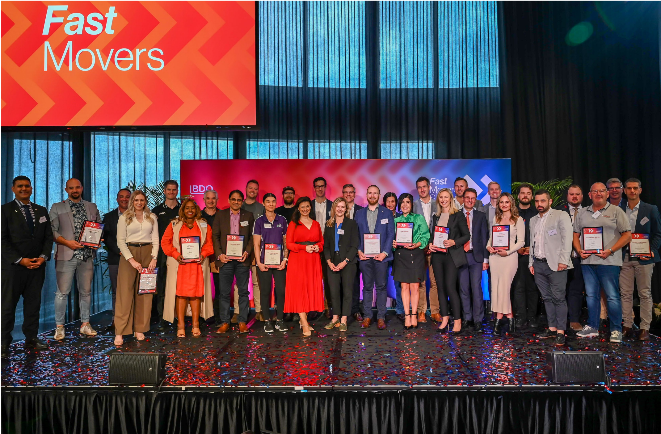
Photo: 2023 Fast Movers Top 25 and sponsors together on stage at celebration breakfast.